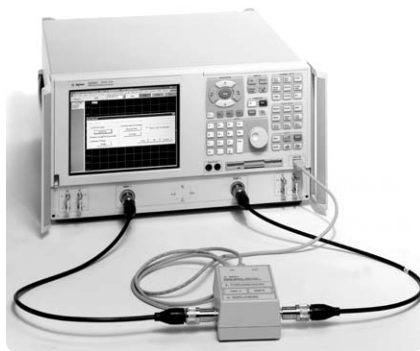
Calibration configuration using the PNA series

ECal modules are controlled directly from the PNA and ENA Series network analyzers. No external PC is required. Simply connect the ECal module to the USB port on the network analyzer. You can control your calibration from the front panel keys of the PNA Series or automatically by your user program.